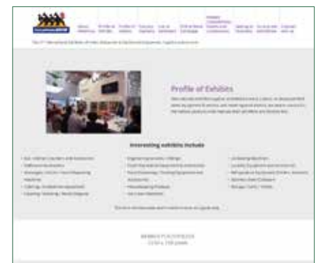
Specialised Exhibition Microsite