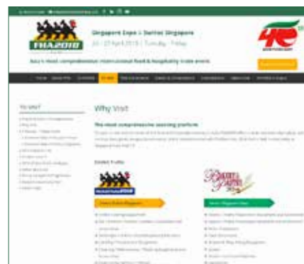
FHA2018 Other Pages